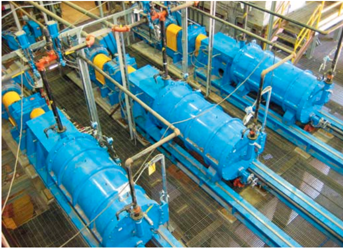
M1000 IsaMills™ at Caribou concentrator, Canada